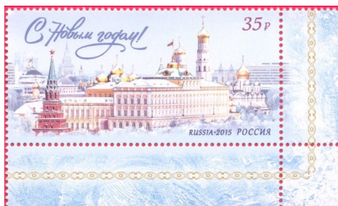
Russia Happy New Year Scott #7706

If you are already a paid up life member, please fill out the membership form with your current info. Mark on the form that you are a life member.